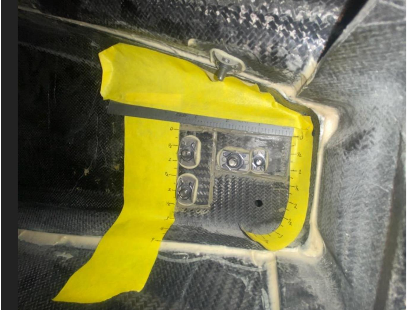
Figure 4: Example of one method to document dimensions of repair plates