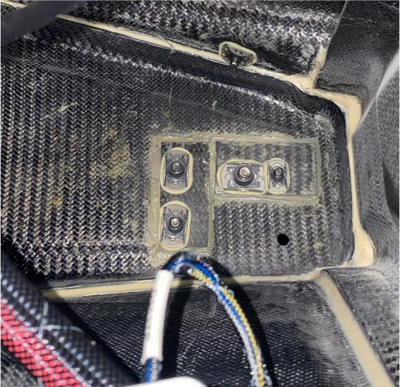
Figure 3: Potentially inadequate repair (measurements must be taken of the repair plates)